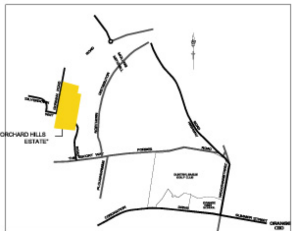
LOCALITY SKETCH NOT TO SCALE

FOR FURTHER INFORMATION CONTACT: PH: 6360 0200